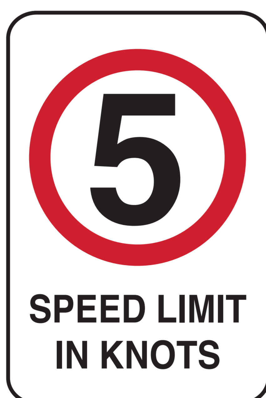
Across the entire lagoon