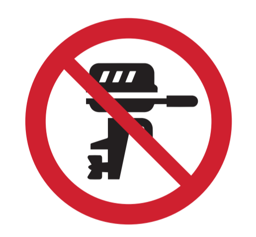
Operation of petrol engines