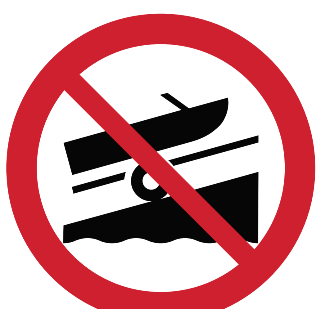
No boat ramp available