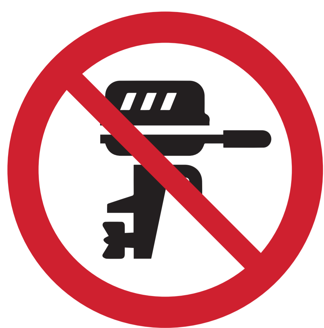
Operation of petrol engines prohibited