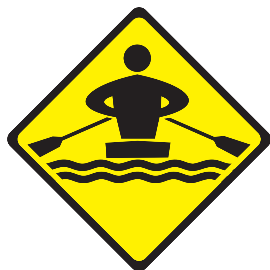
Canoes and kayaks to be carried to waterway via pedestrian access gate