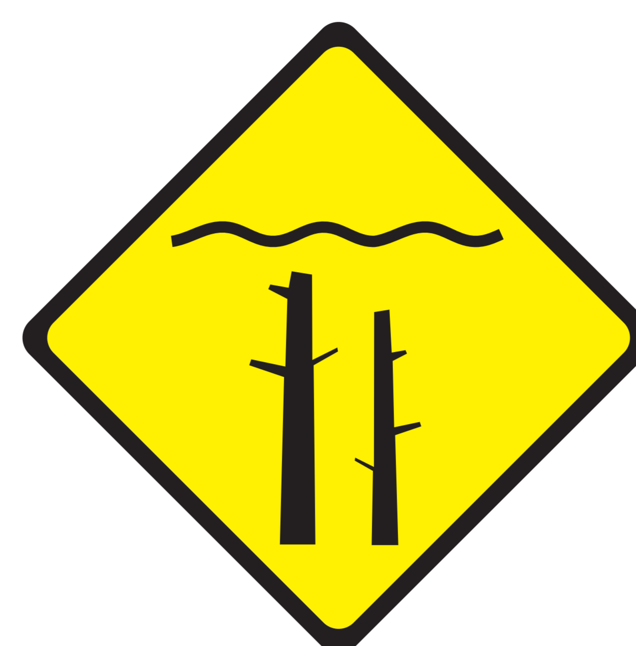
Submerged tree stumps